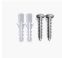
Wall Mounting Kits